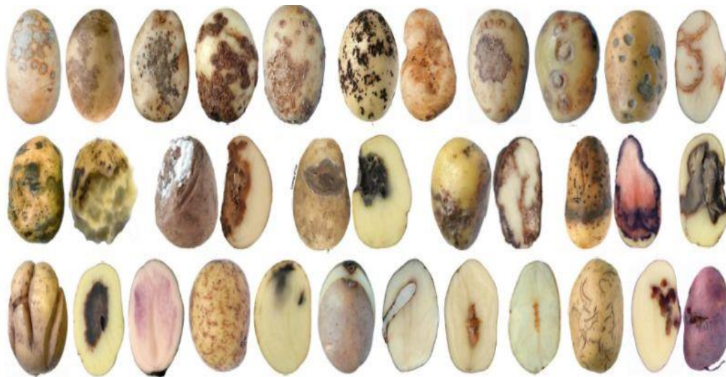
Figure 2. Different types of potato disease.

Configuring the CNN structure is one of the main contributions of the majority of researchers. By looking at articles and studies on CNN on potato classification. Using deep learning-based methods like VGG19, VGG16, Google Net and Alex Net, to compare the findings on the various disease classes with prior research. Table 2 contains this comparison.