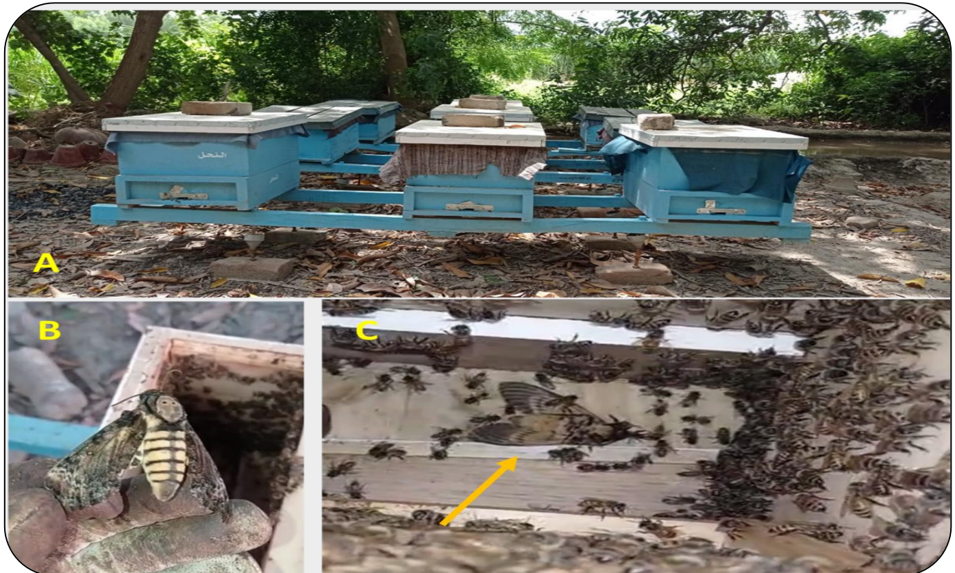
Figure 2. A. mellifera colony visited (A) and was attacked by A. atropos (B,C).

Additionally, during our surveys, we encountered both dead and living specimens of A. atropos inside and outside the Honeybee colonies (Figure 2).