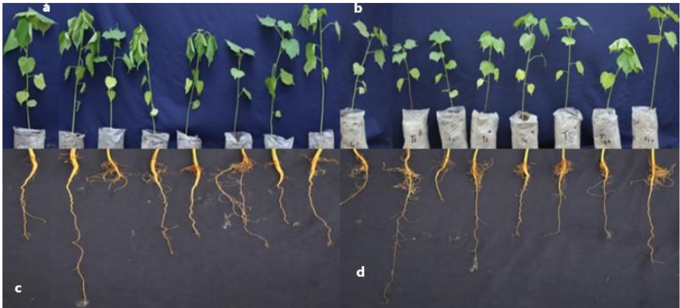
Figure 1: Seedling shoots (a, b) and root growth (c, d) of FH-492 and FH-317 respectively under seven PGR treatments along with control.

Analysis of variance indicated no significant differences in seedling traits for FH-317 and FH-492. Similarly, auxins, gibberellin, and cytokinin showed non-significant effects in determining the final measures of root and shoot traits except for root length in T2 (Figure 1).