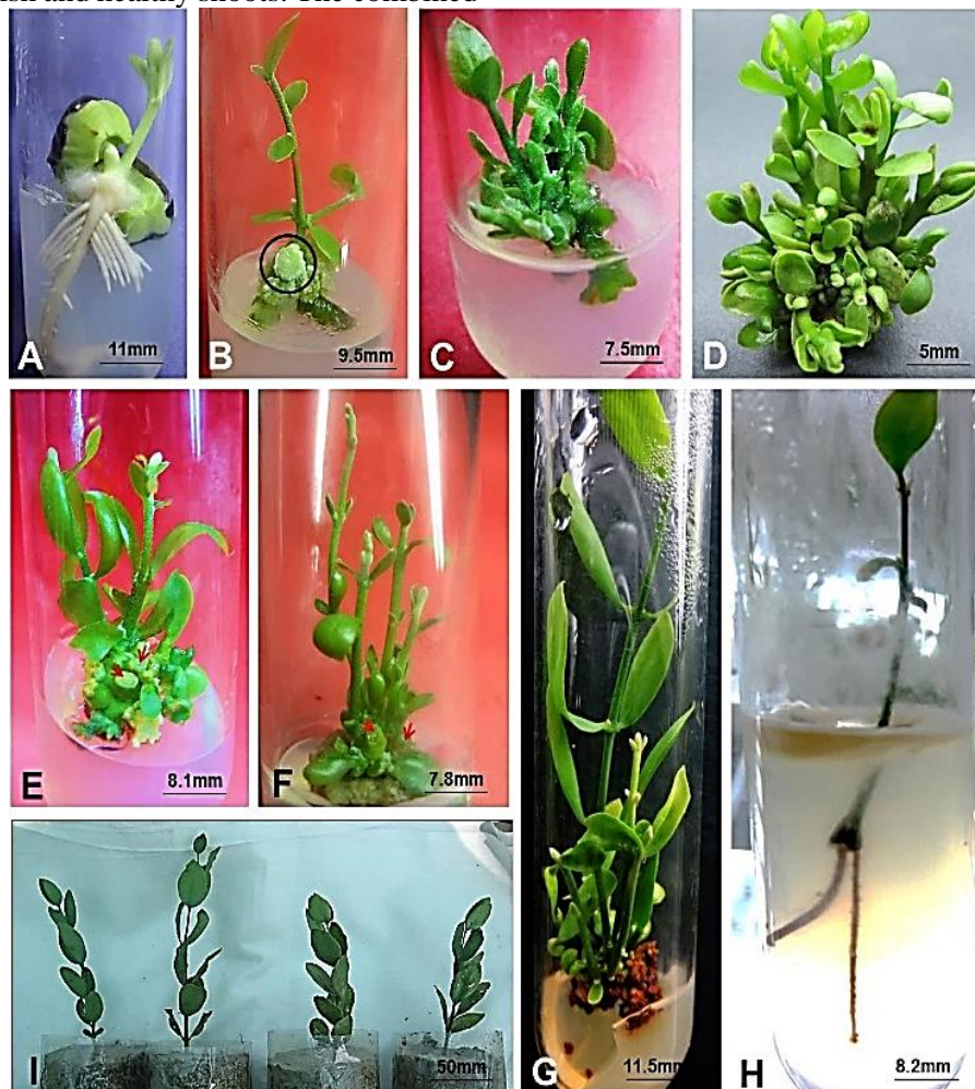
Fig 1. Micropropagation of jojoba on MS medium supplemented with various growth regulators. A) In vitro seed germination on MS medium of 15-day-old. B, C, D) Shoot formation from initial bud culture directly from axenic seedlings at 4 \mu M BAP + 4 \mu M Kin + 1 \mu M IBA, respectively, after 35 days. E, F) In vitro shoot formation from stubs (SS) at 4 \mu M BAP + 4 \mu M Kin + 1 \mu M IBA after the same culture period. G) 60 days old elongating shoot on the medium as described in F. H) Rooted shoot at \frac{1}{2} MS + 12 \mu M IBA + 12 \mu M NAA after 65 days of culture. I) Hardening and acclimatization of plantlets in soil under the glasshouse conditions.

effect of all three PGRs (BAP+Kin+IBA) was more pronounced at their higher concentration levels (Table 3) as compared to the combined effect of cytokinins with NAA.