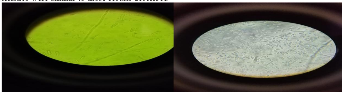
Figure 2: Microscopic confirmation of Fusarium oxysporum f.sp. cepae

The results showed that all fungicides at all test concentrations significantly increased the plant biomasses of onion plants over the control, but biomass production was increased with increasing concentration. Results showed that there was a significant difference statistically among fungicides and their doses in onion plant height. The Topsin-M was found most effective with maximum plant height, followed by Cabrio Top, Score, and Antracol, whereas Mencozeb+Metalxyl was found least effective as compared with other fungicides and provided good results when compared with control. The Topsin-M observed was the most effective fungicide, significantly increasing the plant height (72.30, 66.30, and 58.30cm), while Cabrio Top was observed to be the 2 nd most most effective with plant height (67.36,