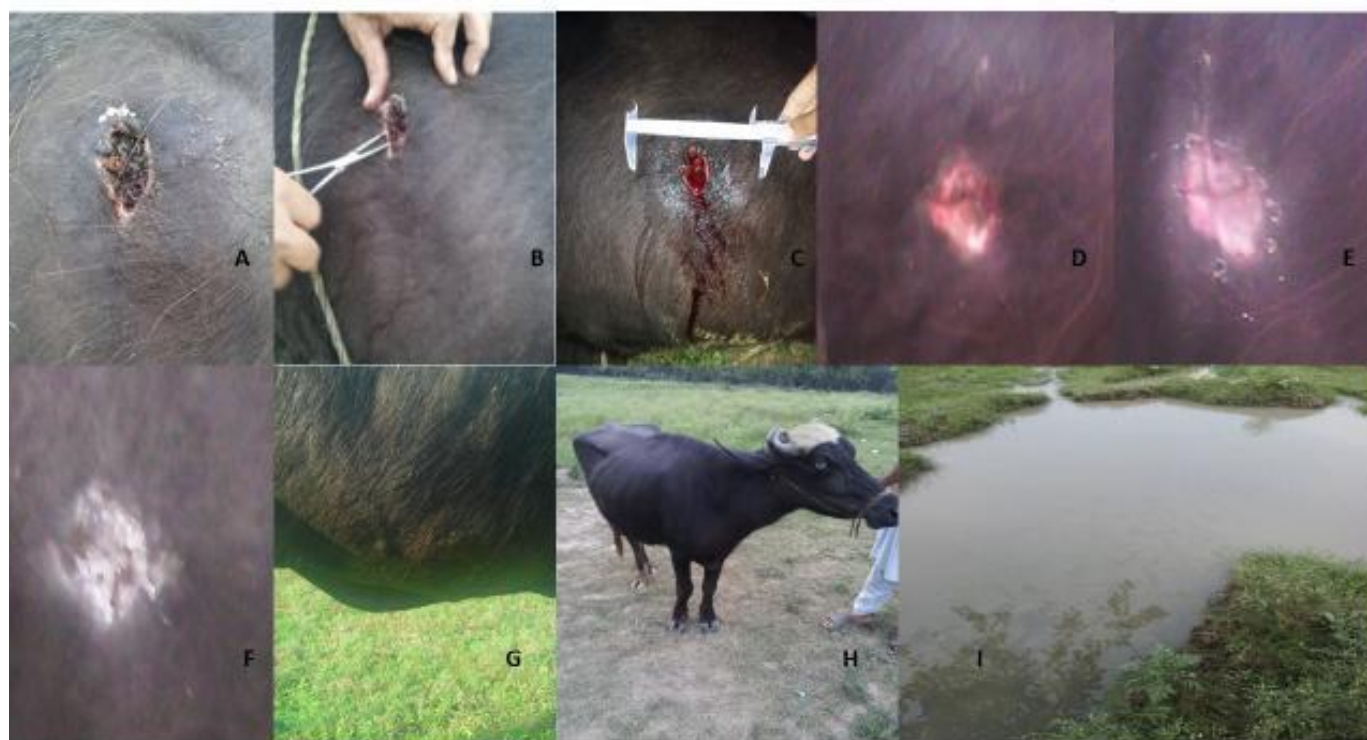
Figure 1. Lesion morphology during treatment and follow-up. Undebrided maggot filled lesion, 16/08/2017 (A), Removal of necrotic tissue, 17/08/17 (B), debrided lesion mouth, 17/08/2017 (C), lesion filled with ground sepran DS powder, 21/08/2017 (D, E), lesion filled with ground sepran DS powder, 24/08/2017 (F), almost healed lesion (G) and animal (H) 28/08/2017, foul water ditch amidst barren land where animal used to sit and drank water from (I).